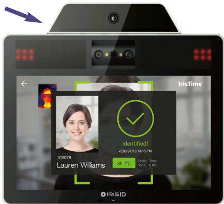
Image shows iT100 with optional Thermal sensor with accurate temperature detection