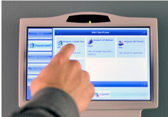
Touch to request time off